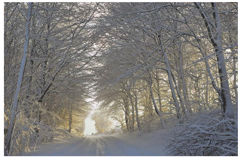
Prayer of Healing

God our Mother, Living Water, River of Mercy, Source of Life, in whom we live and move and have our being, who quenches our thirst, refreshes our weariness, bathes and washes and cleanses our wounds, be for us always a fountain of life, and for all the world a river of hope springing up in the midst of the deserts of despair.