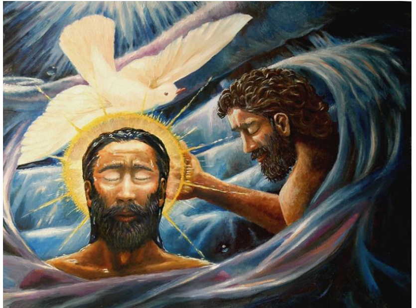
Dave Zelenka, Baptism of Christ